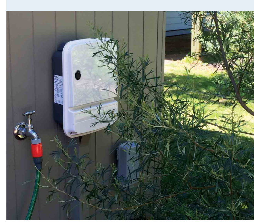
Your OneBox®device is compact and unobtrusive.

* Other than those used in normal domestic products such as dishwashing powder, detergents and hair dyes.